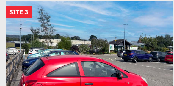
SITE 3 Car Parking Spaces: Ideal kiosk or POD location for a retail/service.

To book a promotional space at Newnham Court Shopping Village please get in touch. Call Access Point on 01704 544999 , email hello@apuk.net or visit www.apuk.net