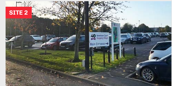
SITE 2 Car Parking Spaces: Ideal location for product placement.