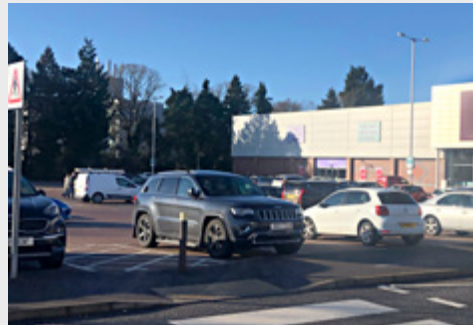
Site 2: 3 parking bays parallel to main road