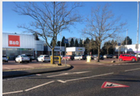
Site 4: 3 parking bays parallel to main road