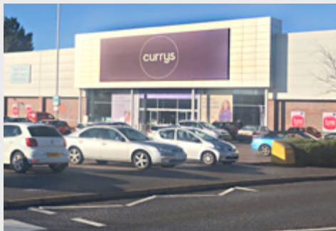
Site 3: 3 parking bays parallel to main road