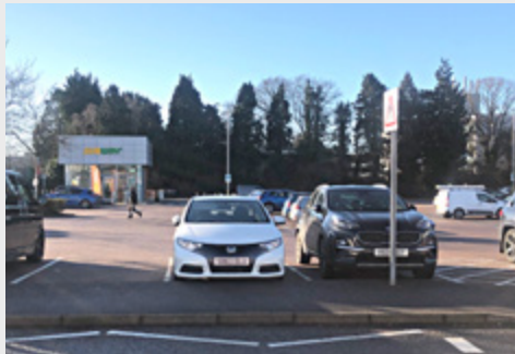
Site 1: 3 parking bays parallel to main road