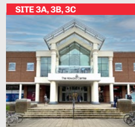
SITE 3A, 3B, 3C Hardstanding promotional area outside the main entrance.