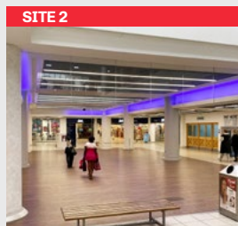
SITE 2 Spacious promotional area suitable for larger events.