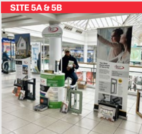
Prime promotional area opposite train station entrance.