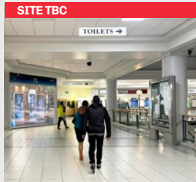
O2/TUI promotional area. Available on request - subject to approval.