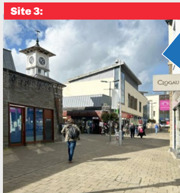
Site 3: Lower End: Multiple sites available along this spacious pedestrian shopping walk lined with retailers and boutiques. Anchored by Carmarthen Market, this site serves as a general communal area. Power is available.