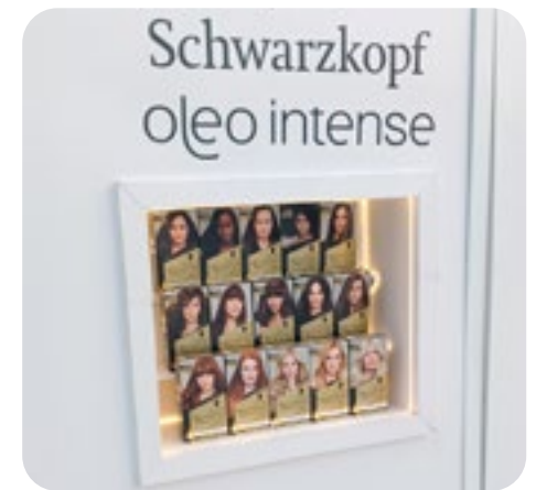
Schwarzkopf sampling at Walkden Shopping Centre, Manchester

At Tesco for instance, In-aisle sampling allows you to place your products in the heart of the store. Using Tesco's nominated brand ambassadors is an effective way of encouraging consumers to switch from competitor brands during their shopping trip or to make an impulse purchase on the back of their sample.