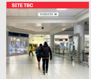
O2/TUI promotional area. Available on request - subject to approval.