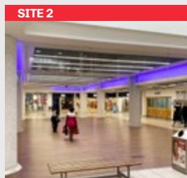
Spacious promotional area suitable for larger events.