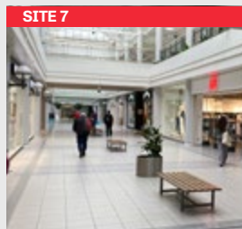
Promotional area adjacent to Monsoon/H&M.