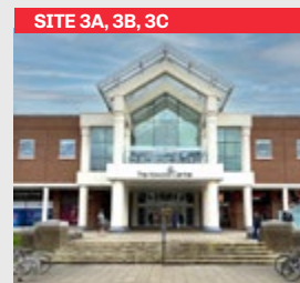
Hardstanding promotional area outside the main entrance.