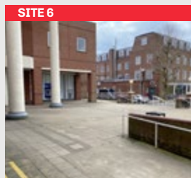
Spacious area next to the bus station. Vehicle access to be checked prior to booking due to stairs and ramp.