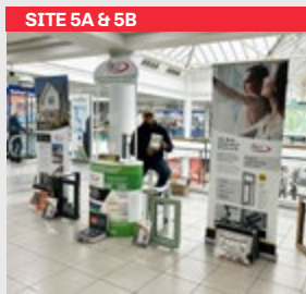
Prime promotional area opposite train station entrance.