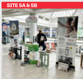
Prime promotional area opposite train station entrance.