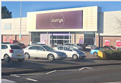
Site 3: 3 parking bays parallel to main road