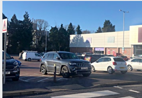
Site 2: 3 parking bays parallel to main road