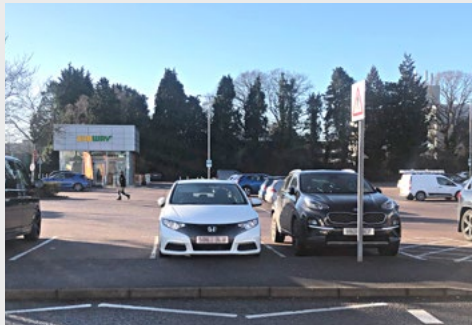
Site 1: 3 parking bays parallel to main road