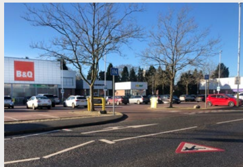
Site 4: 3 parking bays parallel to main road