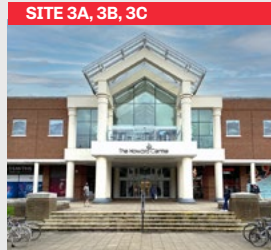
Hardstanding promotional area outside the main entrance. 16amp power available.