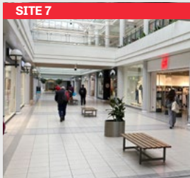
Promotional area adjacent to Monsoon/H&M. 13 amp power available.